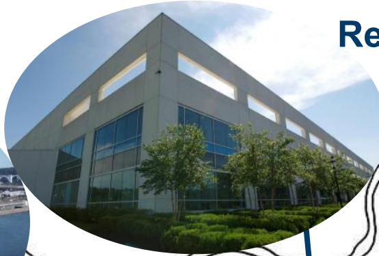
Research and Technology Center