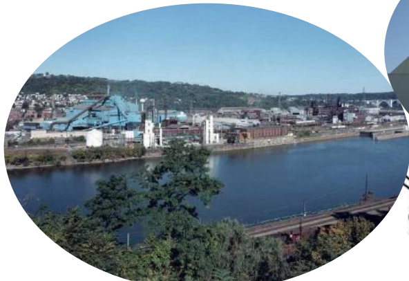
Edgar Thomson Plant